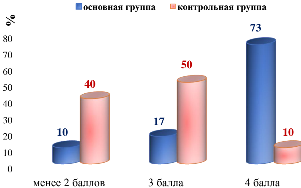
Figure 1. Results of adherence assessment using the Morisky-Green scale in patients after 3 months of therapy.