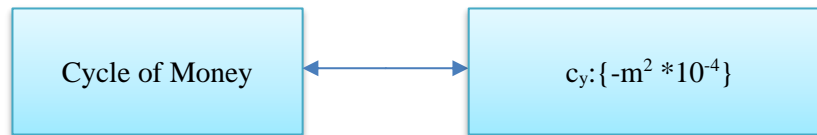
Figure 1: Cycle of money for c_y: \{-m^2 * 10^{-4}\}

The fixed length principle is satisfied when the public policy with the lower taxation of uncontrolled transactions and the higher taxation of the controlled transactions is applied.